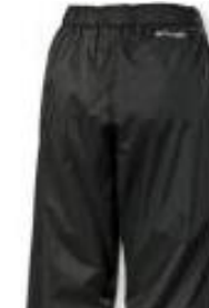
Wind Break & Rain