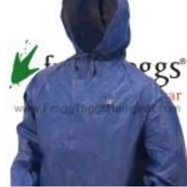
Wind Break & Rain