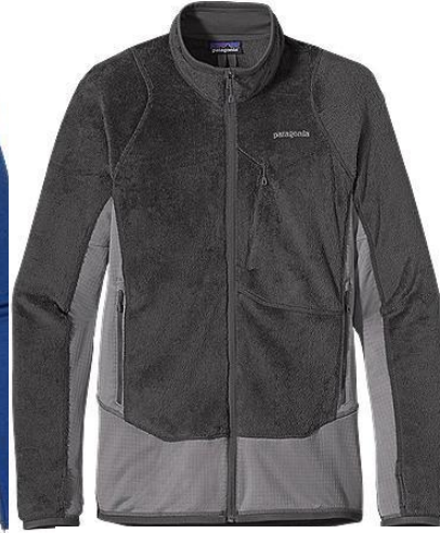
Fleece (or Down)