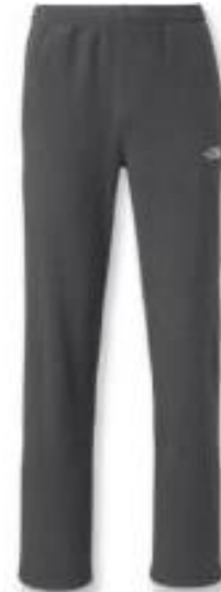
Fleece or Thermals