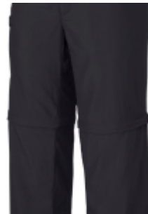
Quick Dry Hiking Pants